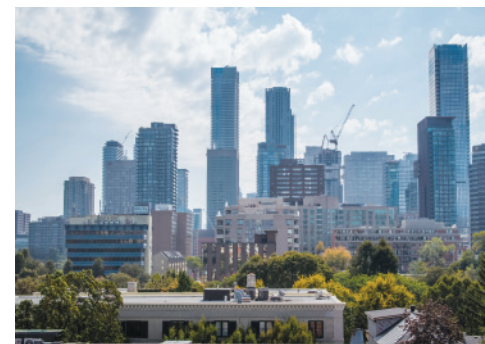
← SOUTH VIEW, LEVEL 4