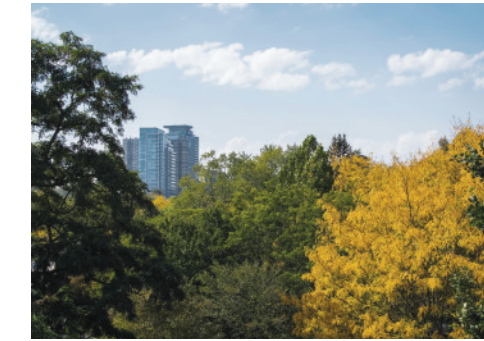
↑ WEST VIEW, LEVEL 4