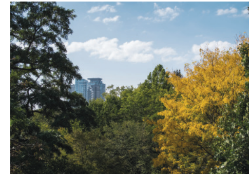
↑ WEST VIEW, LEVEL 3